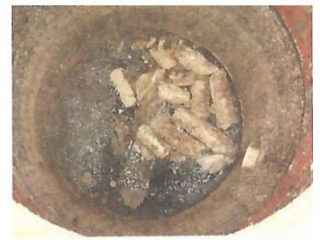
Grease from private lines accumulated in manhole.